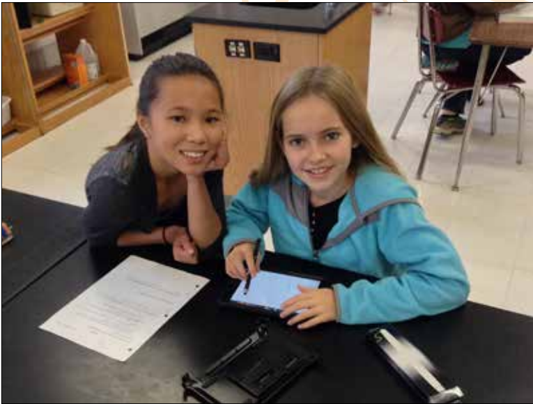
Students benefit from working on assignments in class.

Students Enjoy More Time in Class to Work on Assignments