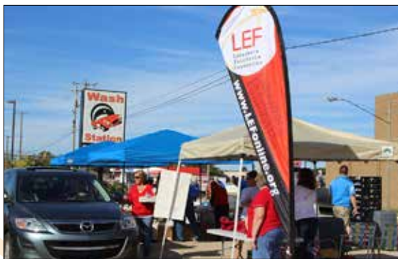
The Lakeshore Rotary & LEF Pulled-Pork Dinner takes place each year before the Lakeshore Homecoming game.

The event took place before the Lakeshore Homecoming football game. The Hickory Pit Restaurant from Saugatuck again prepared the delicious pulled-pork. Rotarians worked assembling and selling over 1,000 dinners and large trays of pork for takeout. The LEF trustees sold homemade desserts, water, and soda to complete the meals. Both groups had a great time working together, and trying to keep up with the lines of cars and customers. The LEF made over $2,000 for their efforts. Proceeds benefited the Rotary's North Lake Park Project and Lakeshore Excellence Foundation Projects.