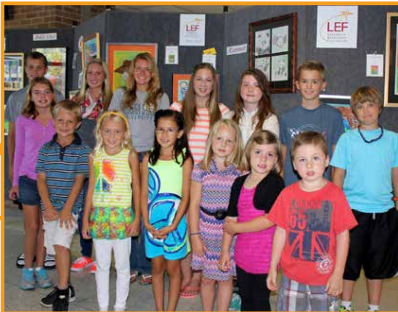
Art Around Town features student artwork at area businesses.