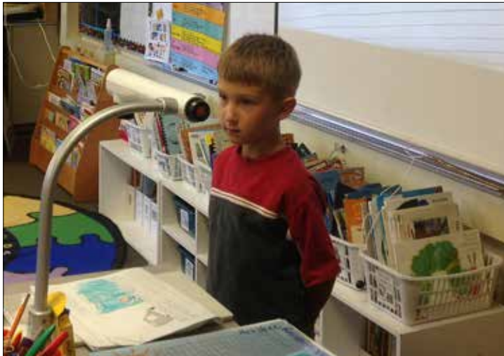
Technology enhances the learning experience at Lakeshore.