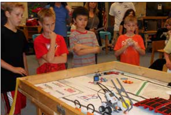
Students enjoy working together to problem solve.

FLL teams are building a series of obstacles out of LEGOS®, and then programming a robot to accomplish certain tasks. This year's theme is Nature's Fury and the obstacles include tasks such as moving an ambulance, erecting a caution sign, and reuniting family members and pets.