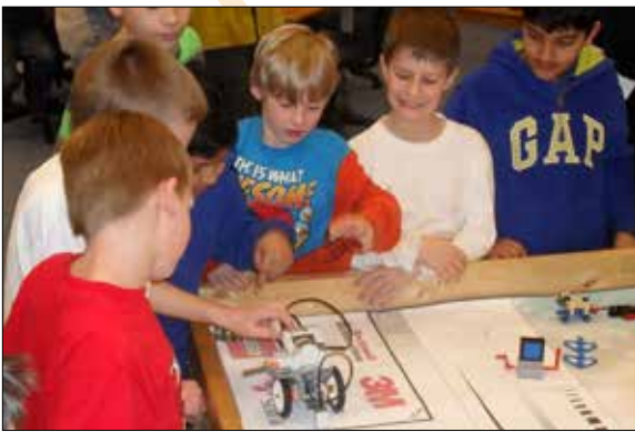
The LEGO® League captures student curiosity.

This year, with a generous grant from the Lakeshore Excellence Foundation, LEGO® League has expanded to include all three elementary schools with Junior Lego League (Jr. FLL) and First Lego League (FLL), impacting over 100 Lakeshore students.