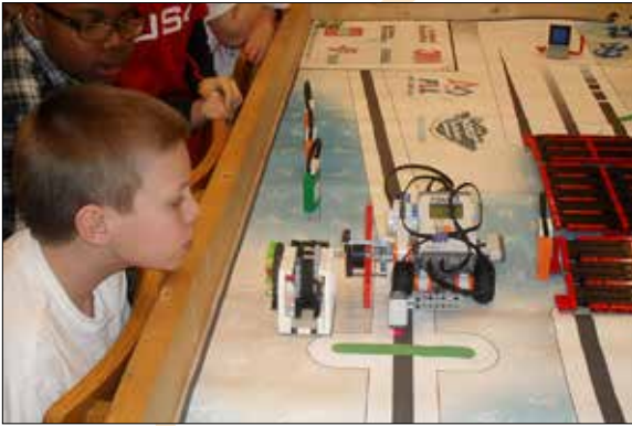
Elementary LEGO® League

For two years, Stewart Elementary facilitated sessions of First LEGO® League as a way to enrich students in problem solving and cooperation while drawing on the passion of building with LEGOS®. The first year, 10 students participated. The second year the number grew to over 40 participants.