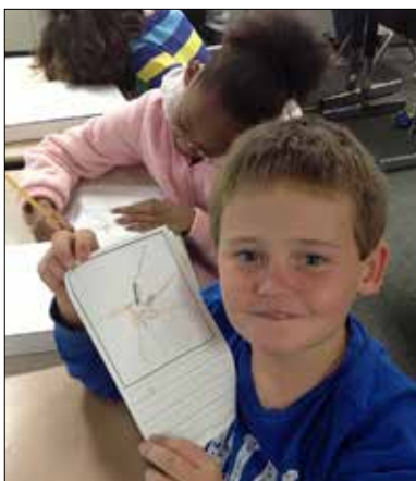
Students enjoy learning botany through drawing and writing about plants and gardens.

During the visits, students receive 70-minutes of instruction in drawing realistic, accurate images of plants and plant parts, while listening to information about plant life cycles and process. Students also write down observations, questions, and new ideas about plants, collecting them along with their drawings in special folders.