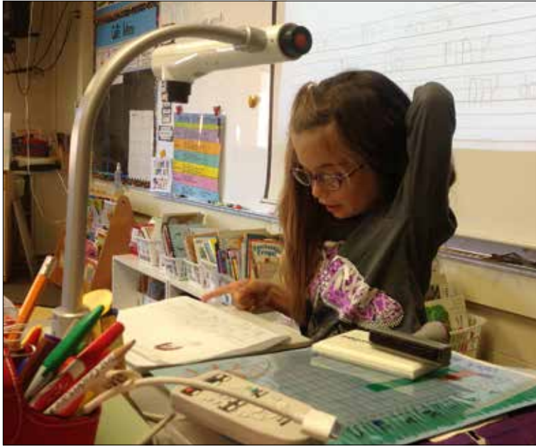
Journal writing is more fun using the document camera.

74 classrooms received technology improvements as a result of the 2012/2013 technology campaign. Final classroom improvements were made prior to the start of the 2013/2014 school year. The final round included the following teachers/classrooms: